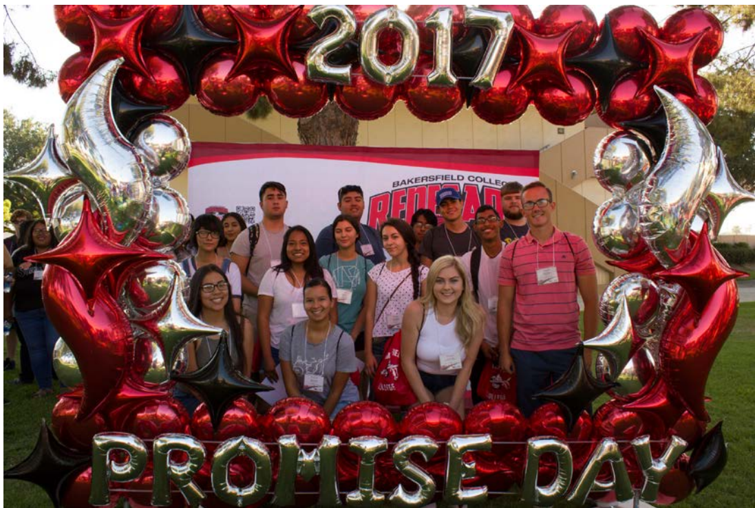
Bakersfield College 2017 Kern Promise Transfer Cohort students at their Signing Day | August 10, 2017