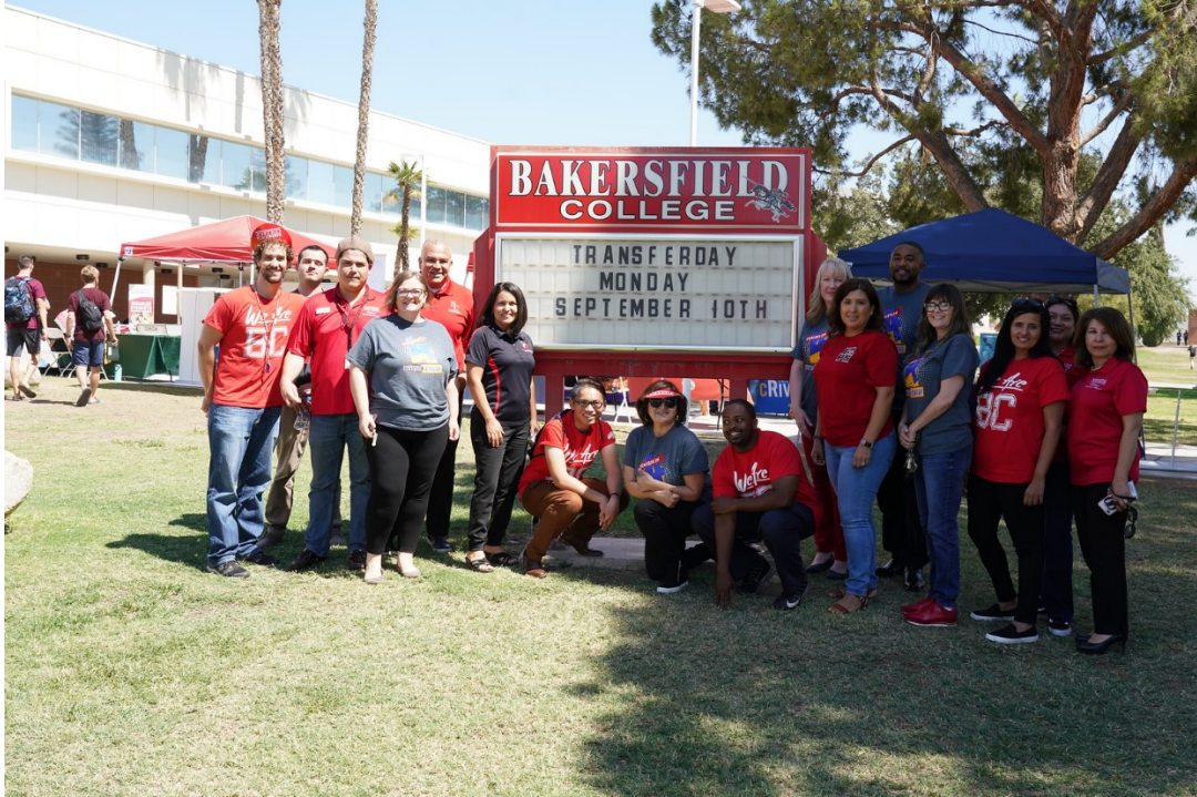
Bakersfield College Transfer Counseling Team Celebrating Transfer Day | September 10, 2018