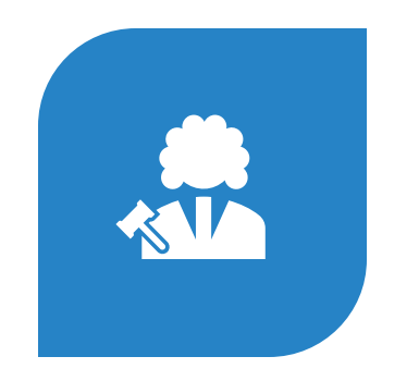
Title 5 is the education section of the california code of regulations (ccr)

The california code of regulations is the official publication of regulations that are adopted, amended or repealed by state agencies. Ccr contains 27 "titles"