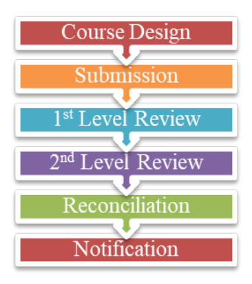
Figure 1: Annual Review Process

CCCs submit new or revised course outlines of record (COR) to the CSU and UC system offices electronically via ASSIST. Intersegmental faculty and staff then evaluate the outlines for alignment with the respective policy documents. CCCs are responsible for submitting accurate and current course outlines. If a course has a decrease in units or has changed substantially since its last review, a CCC should select "Substantial Change" during the course submission process. (For a description of what counts as a "substantial" change, see Submission, below.)