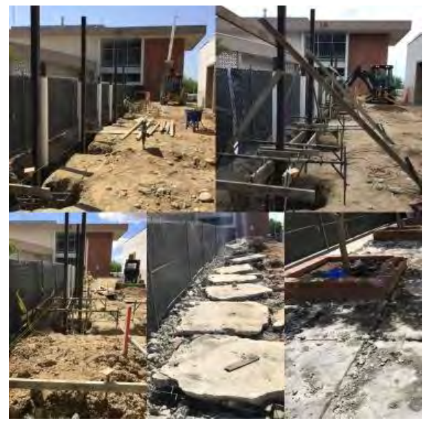
Construction taking place on the Veterans Resource Center