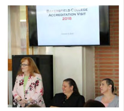
Photo: Chancellor Kathleen Burke stands at the formal Exit Report in Oct. 2018

compliance and zero recommendations for improvement, a rare feat in higher education. The full accreditation report for Bakersfield College is available to the public and is posted on the institutional webpage.