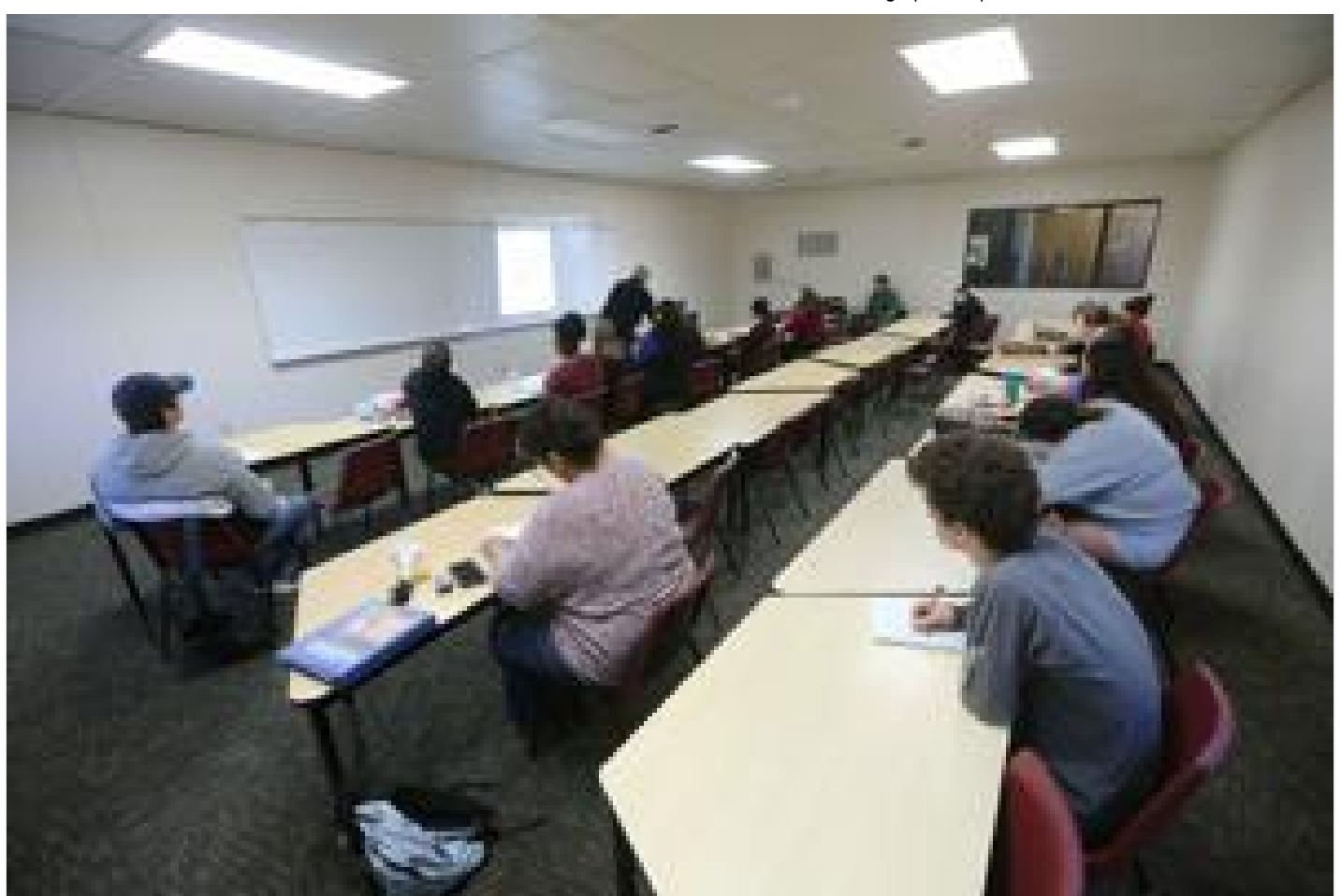
New program at BC focused on combating effects of teacher shortage