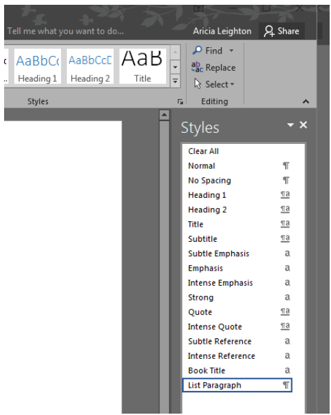
Figure 1 - Styles Dock anchored on the right of the screen